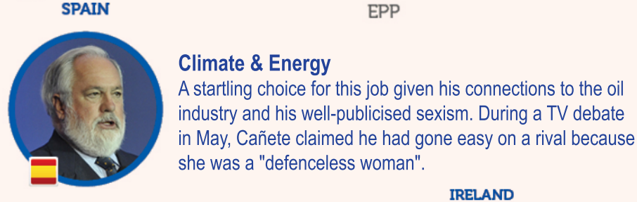
Miguel Arias Cañete Former Agriculture Minister 64