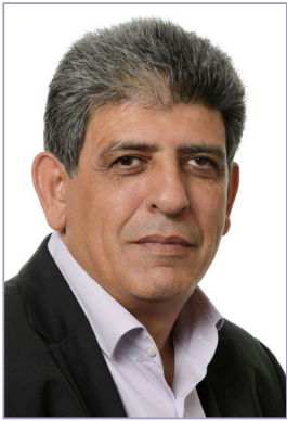
Neoklis SYLIKIOTIS AKEL - Cyprus