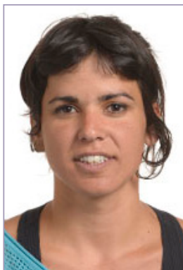
Teresa RODRÍGUEZ-RUBIO VÁZQUEZ PODEMOS - Spain