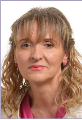
Martina ANDERSON SINN FÉIN Ireland