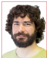
João Calado Pimenta Lopes (Portugal), Vice-Chair FEMM