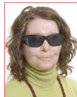
Kostadinka Kuneva (Greece), Substitute Member FEMM