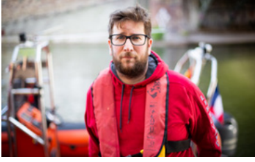
Miguel Urbán (Podemos, Spain):

“The EU and its member states must choose between saving lives or being complicit for the deaths of thousands at sea. The xenophobic right-wingers and the extreme neoliberals are destroying a Europe for its people. To prevent more deaths, we must stop the criminalisation of life-saving NGOs. Further, we urgently need a civil search and rescue system in the Mediterranean that complies with international law.”