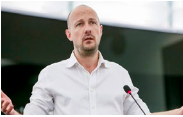
Marc Botenga (PTB, Belgium)

"To beat a pandemic such as the one we're facing, we need future vaccines and treatments to be universally accessible. This is not only a matter of justice but also an issue of public health. The WHO set up a patent pool where all knowledge can be shared. The EU must ensure medicines developed with public research funds are included in this pool."